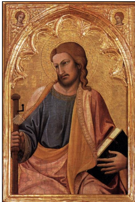
ANTONIO VENEZIANO, Apostle James the Greater, C. 1384