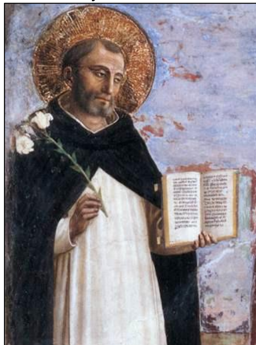
ANGELICO, Fra, Virgin and Child with Sts Dominic and Thomas Aquinas (St. Dominic detail) c. 1445