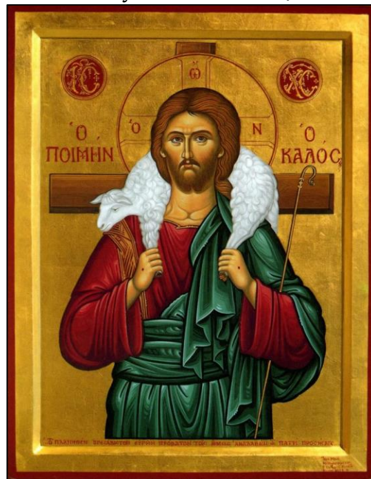
Icon of The Good Shepherd