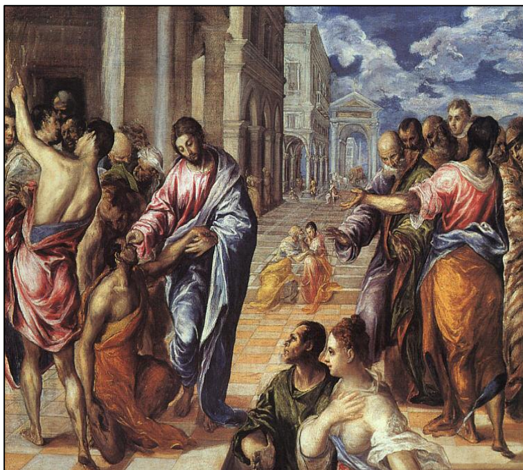
EL GRECO, Christ Healing the Blind, 1570s