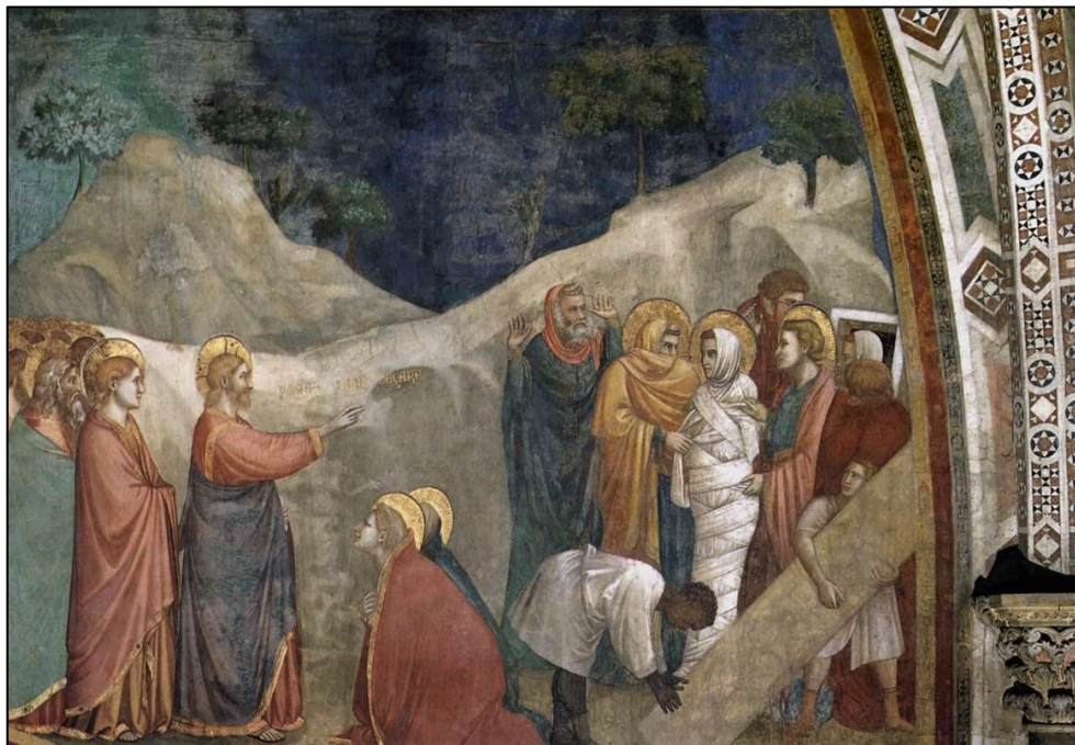
GIOTTO de Bondone, Raising of Lazarus