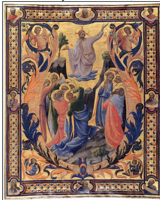
LORENZO MONACO, Antiphonary c. 1410