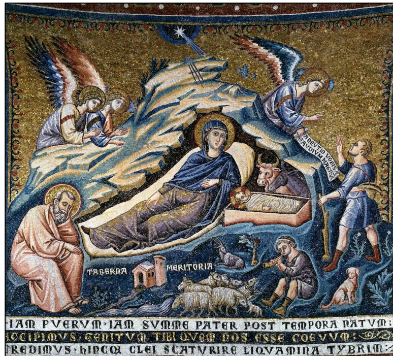
CAVALLINI. Pietro, Nativity of Christ 1296-1300