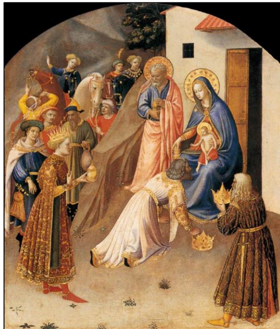
ANGELICO, Fra, Adoration of the Magi, 1423-24