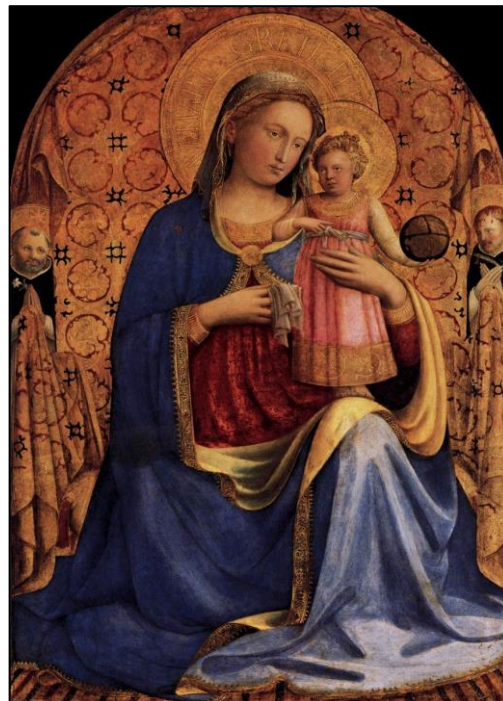
ANGELICO, Fra. Madonna and Child