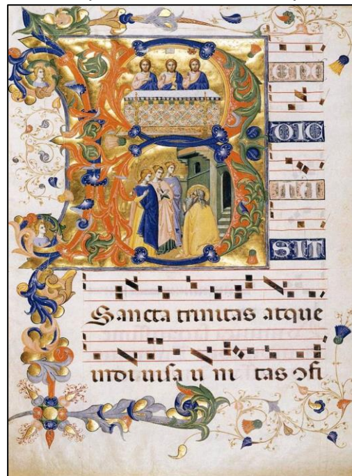
Don Silvestri dei GHERARDUCCI, Gradual 2, c. 1395