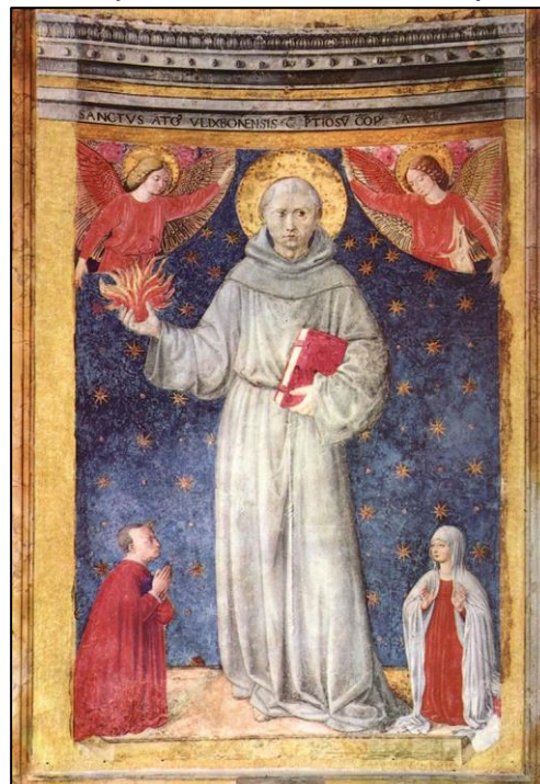
GOZZOLI, Benozzo, St Anthony of Padua, 1450s