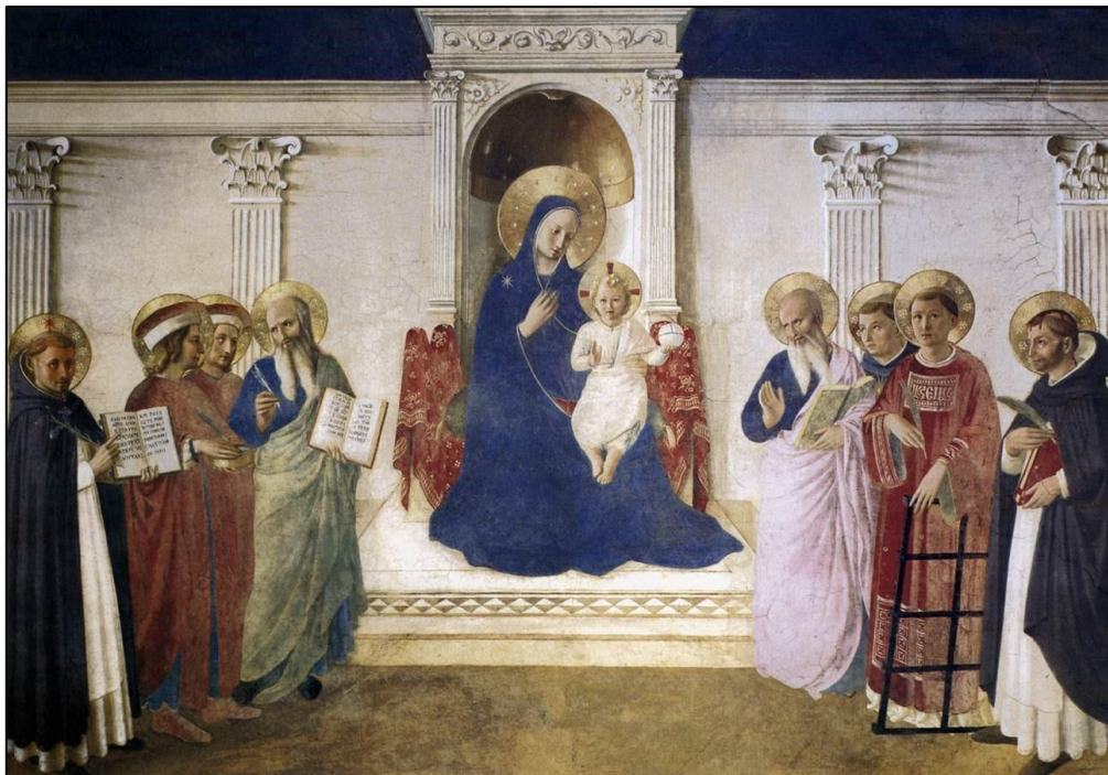
ANGELICO, Fra, Sacra Conversazione, c 1443