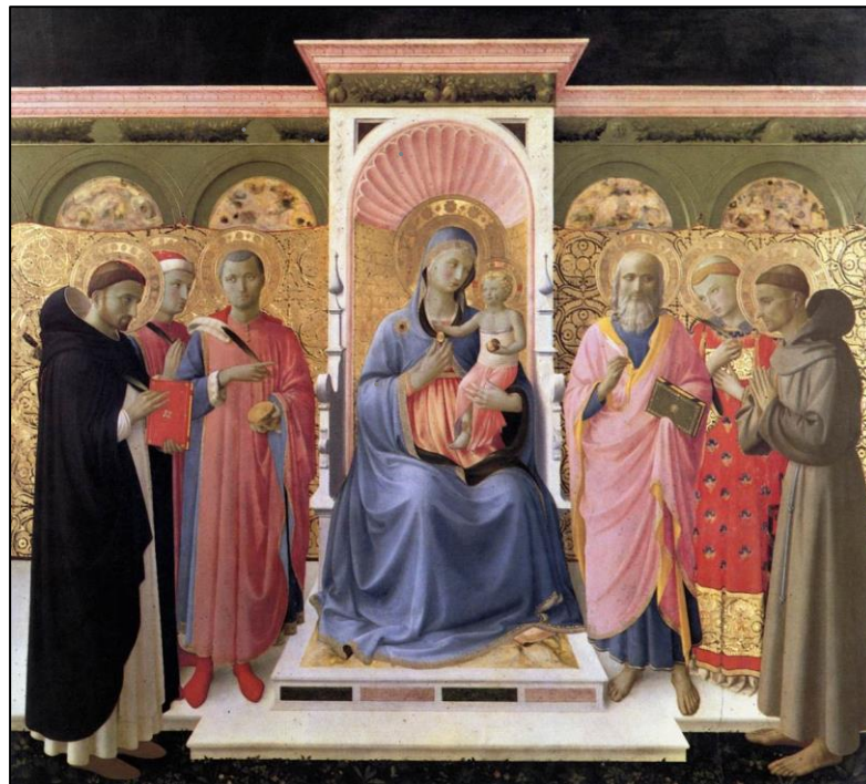
ANGELICO, Fra, Annalena Altarpiece (without predella), c. 1435