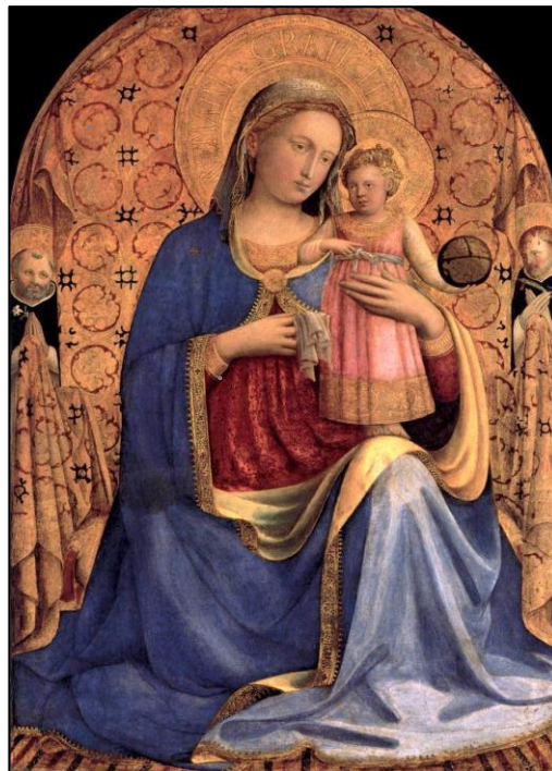
ANGELICO, Fra. Madonna and Child, 1433