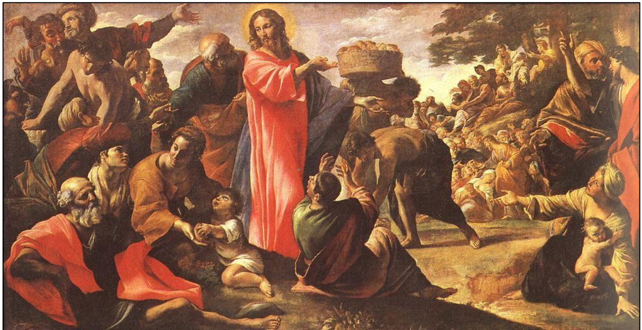
LANFRANCO, Giovanni, Miracle of the Bread and Fish, 1620-23