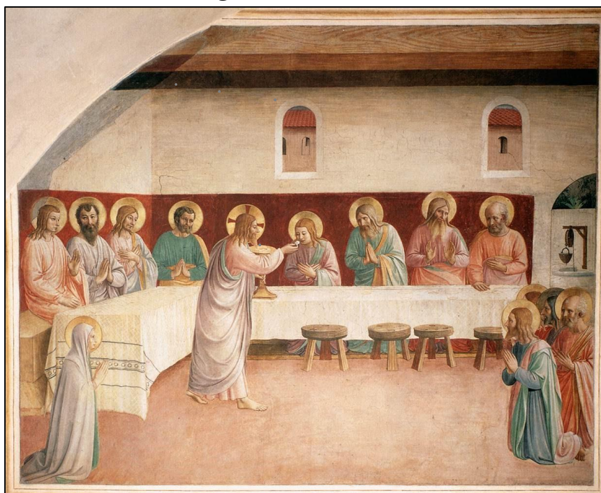
ANGELICO, Fra, Institution of the Eucharist (Cell 35), 1441-42