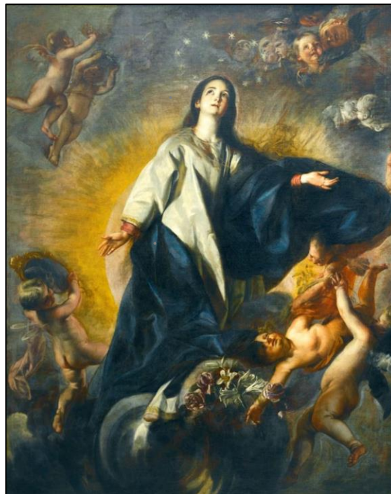
CABEZALERO, Juan Martin, Assumption of the Virgin, ca. 1670