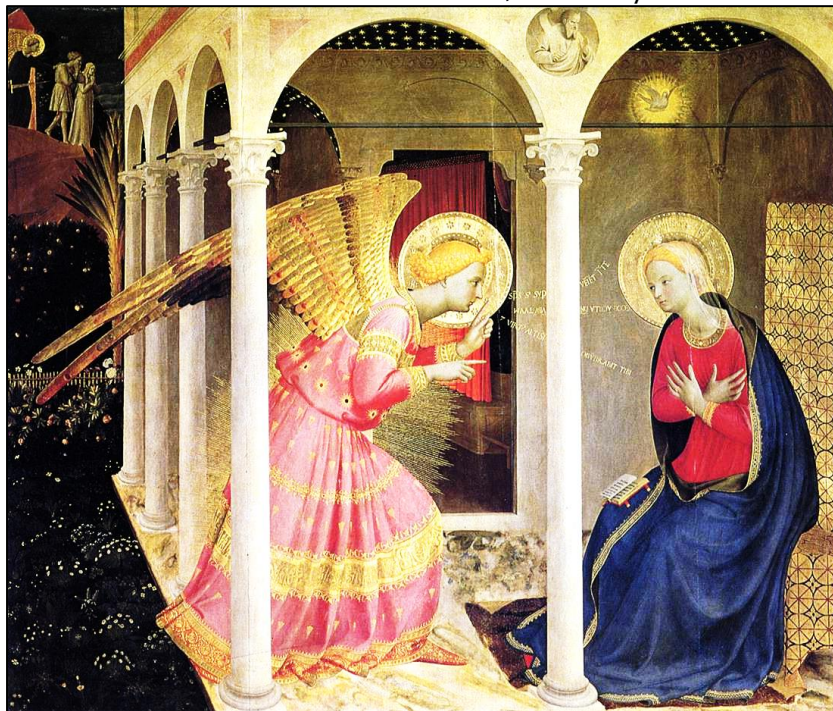
Fra Angelico, The Annunciation, 1433-1434.