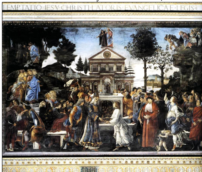
BOTTICELLI, Sandro, The Temptation of Christ, 1481-82