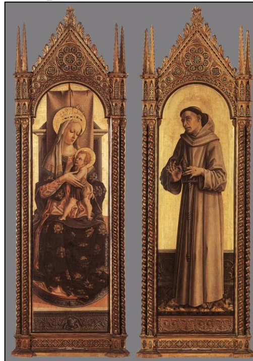
CRIVELLI, Carlo, Madonna and Child; St Francis of Assisi, 1471-72