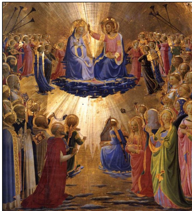
ANGELICO, Fra, The Coronation of the Virgin, 1434-35