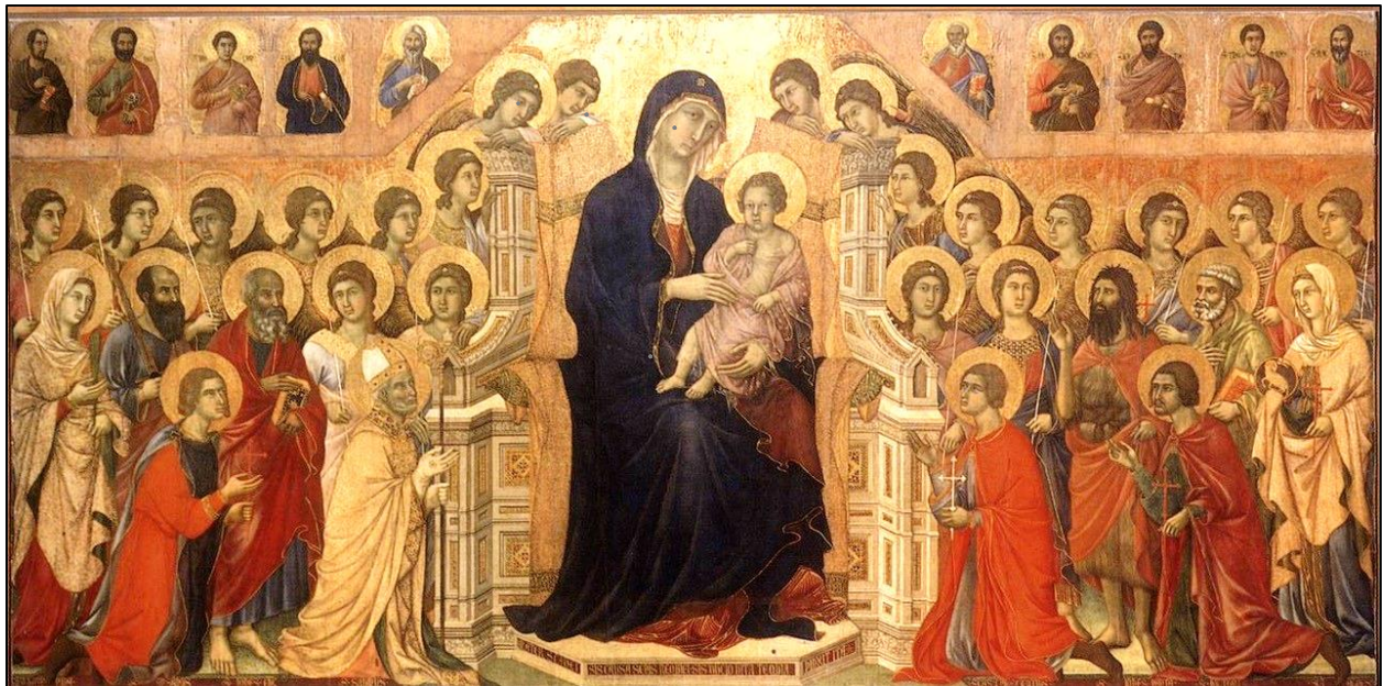
DUCCIO di Buoninsegna, Maestà (Madonna with Angels and Saints) 1308-11