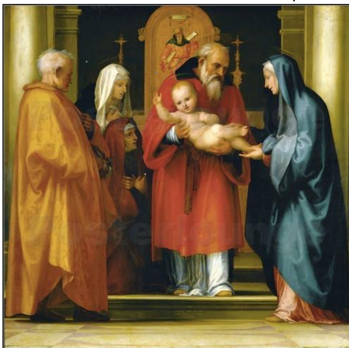
ANGELICO, Fra, Presentation of Jesus in the Temple, 14440