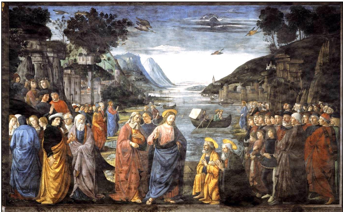
GHIRLANDAIO, Domenico, Calling of the Apostles, 1481, Cappella Sistina, Vatican