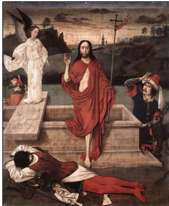
BOUTS, Dieric the Elder, Resurrection, 1450-60