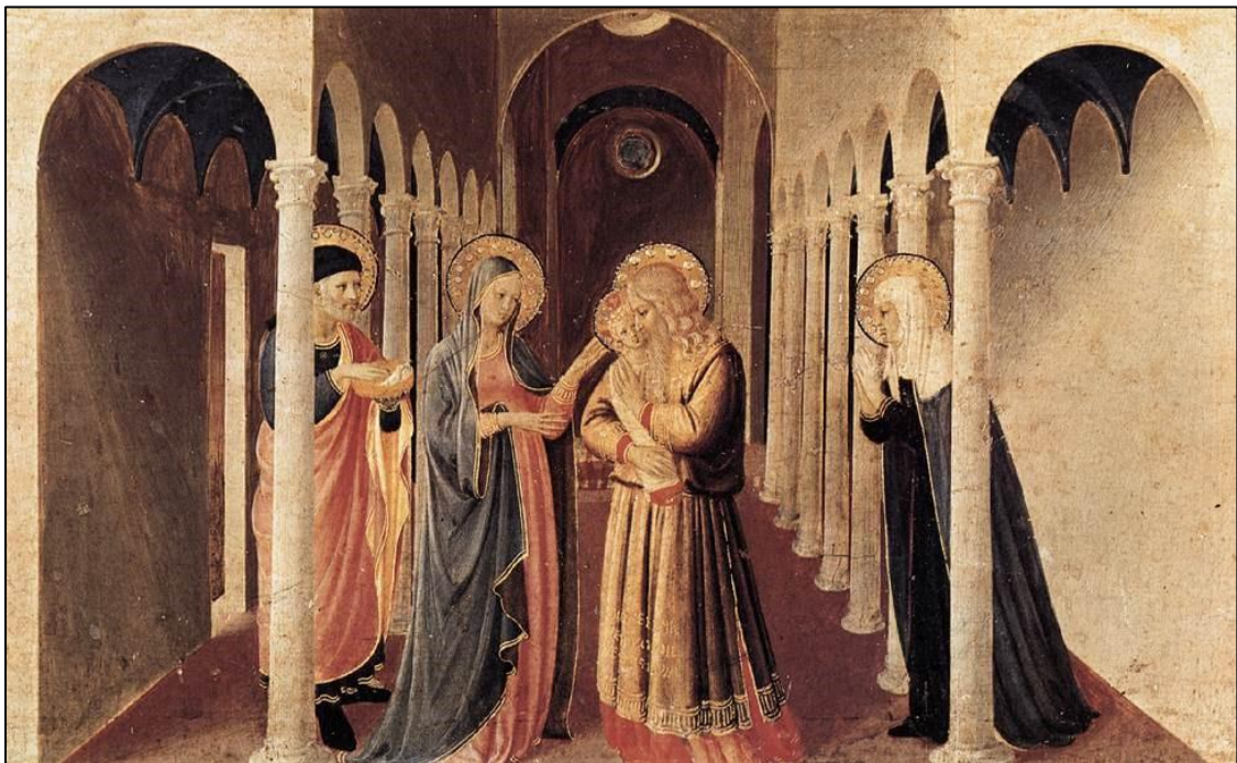
Angelico, Fra, The Presentation of Christ in the Temple, 1433-34