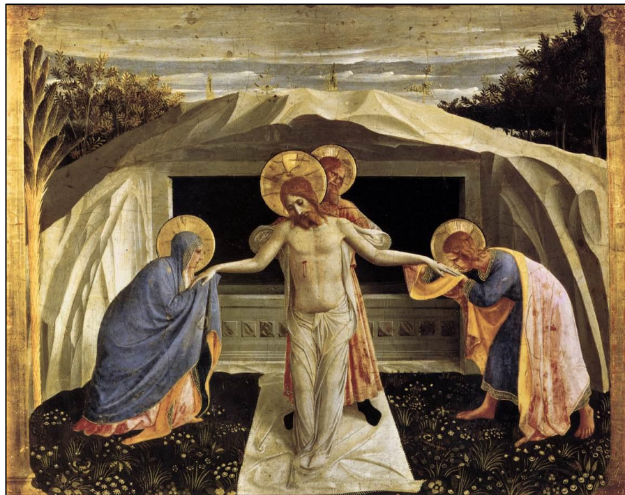
ANGELICO, Fra, Entombment, 1438-40