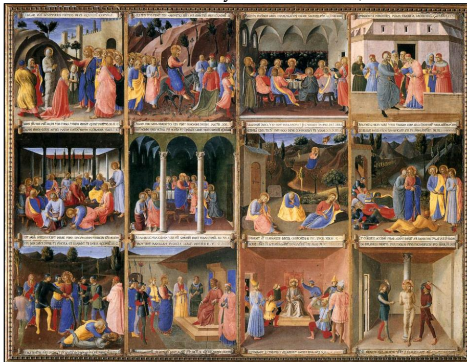
ANGELICO, Fra, Scenes from the Life of Christ, 1451-52