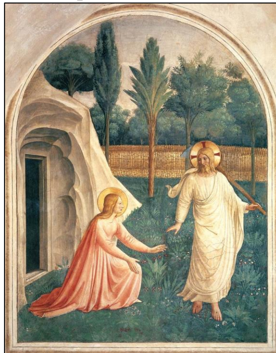
ANGELICO, Fra, Noli Me Tangere, 1440-1442