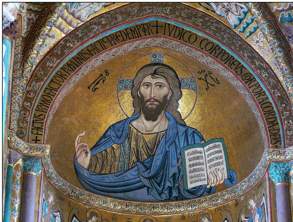
Christ Pantokrator, Mosaic from Cefalu Cathedral, Sicily