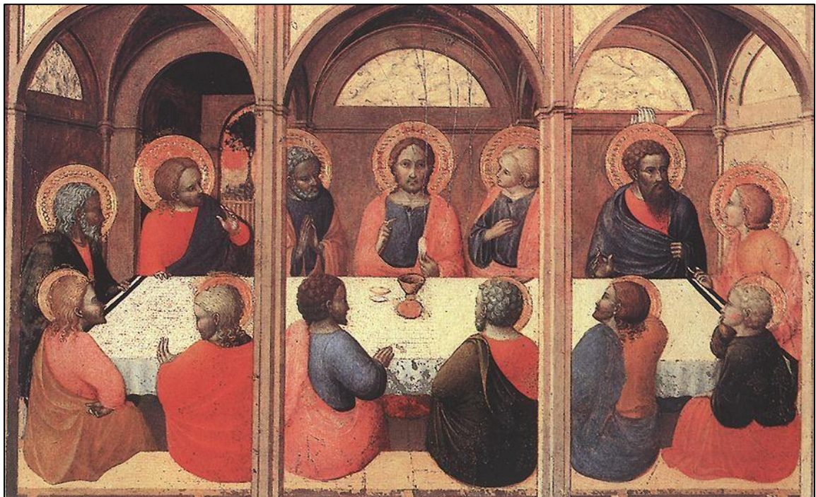
SASSETTA, Stefano di Giovanni, The Last Supper, 1423