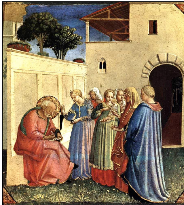
Fra ANGELICO, The Naming of St John the Baptist 1434-35