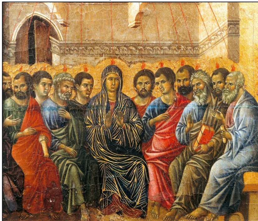
DUCCIO di Buoninsegna, Pentecost, 1308-11