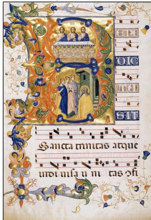
GHERRARDUCCI, Don Silvestri dei, Gradual 2, c. 1395