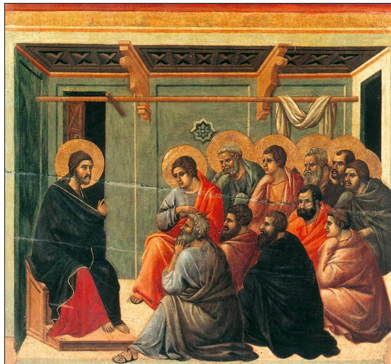
BUONINSEGNA, Duccio di, Christ Taking Leave of His Apostles, 1308-11