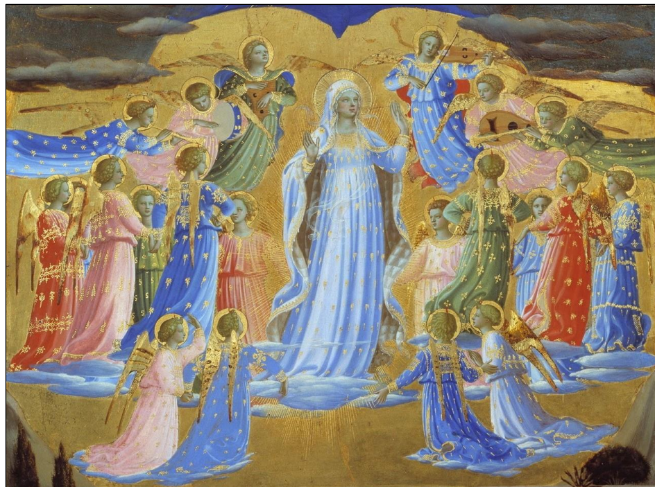
ANGELICO, Fra, Assumption of the Blessed Virgin Mary, 1432