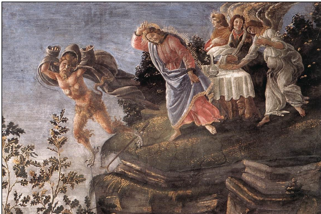
BOTTICELLI, Sandro, The Temptation of Christ (detail), 1481-82