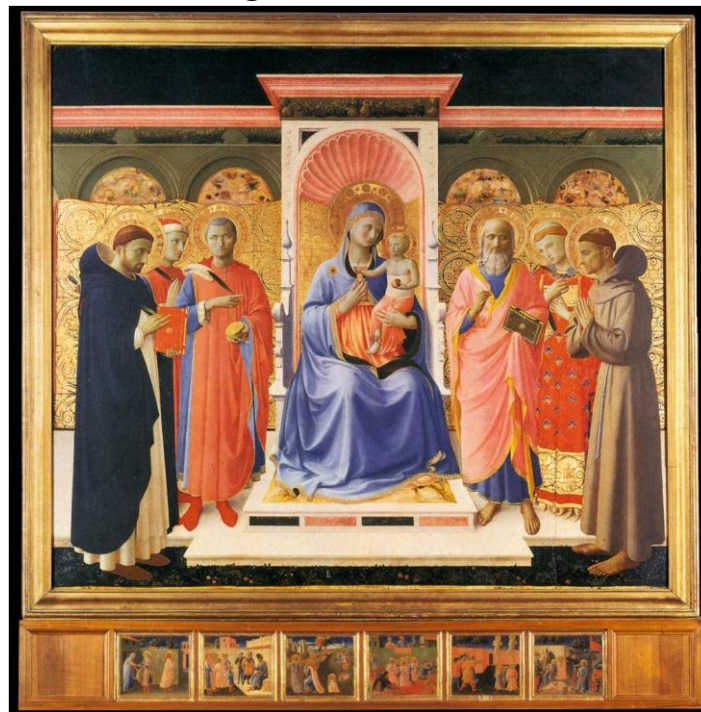
ANGELICO, Fra, Annalena Altarpiece, 1435