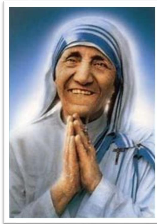
St Teresa of Calcutta