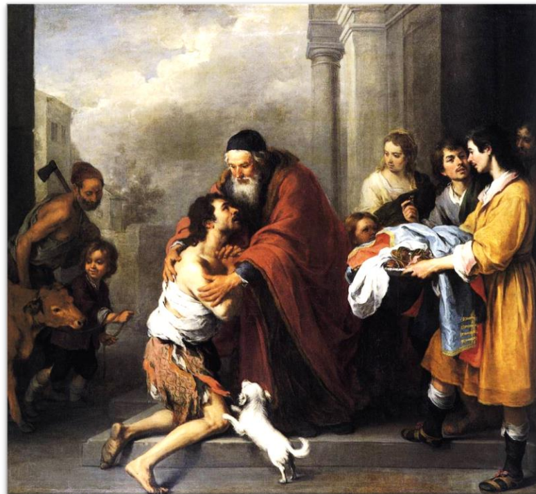
MURILLO, Bartolome Esteban, Return of the Prodigal Son, 1667-70