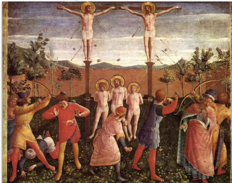
ANGELICO, Fra, St Cosmas and St Damian Crucified and Stoned, 1438-40