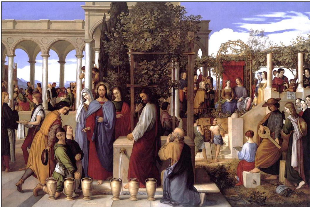
SCHNORR VON CAROLSFELD; Julius, The Wedding Feast at Cana, 1819