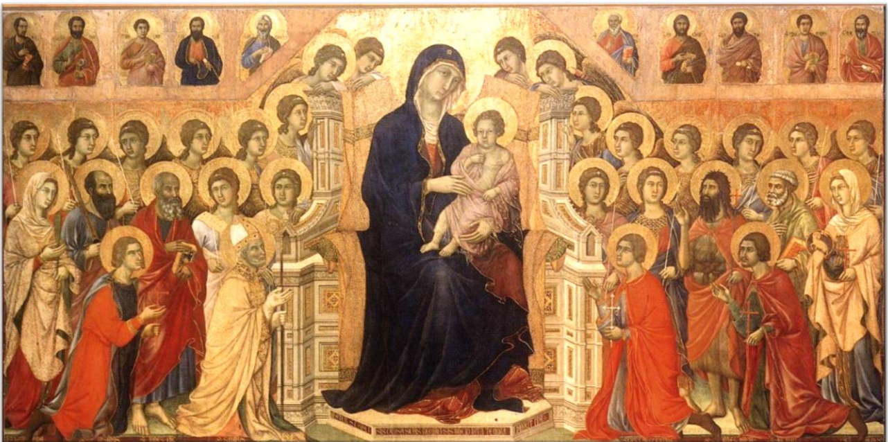
BUONINSEGNA, Duccio di, Madonna with Angels and Saints, 1308-11