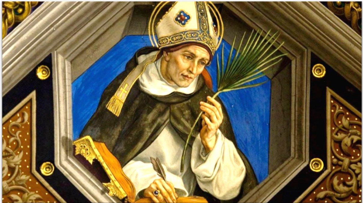
Saint Albert the Great