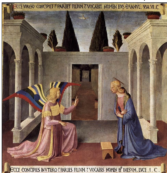
ANGELICO, Fra, The Annunciation, 1451-52