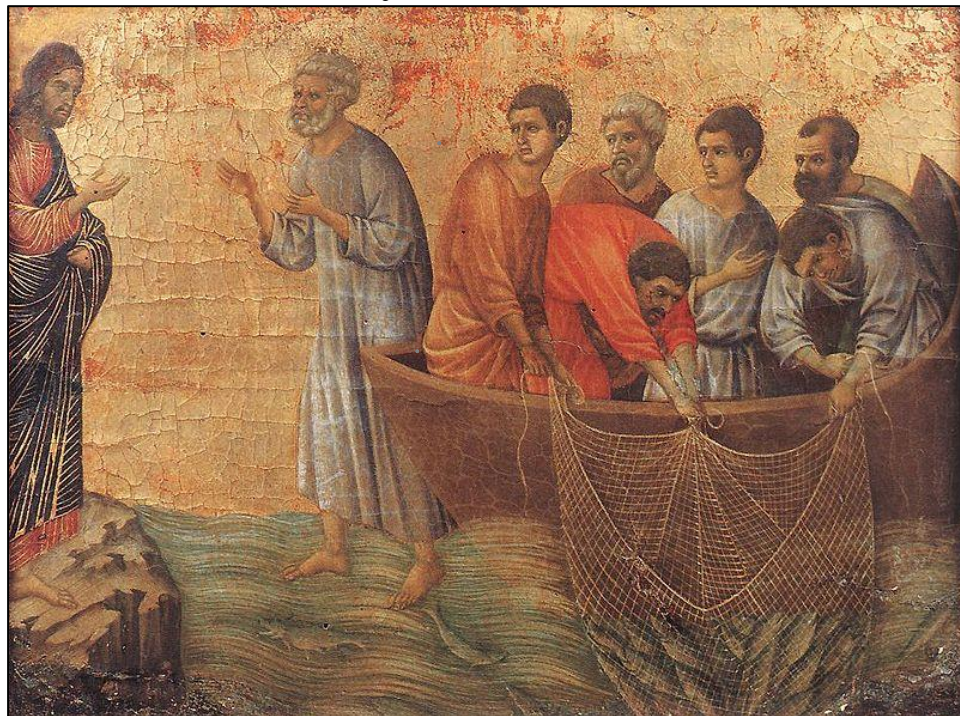
BUONINSEGNA, Duccio di, Appearance on Lake Tiberias, 1308-11