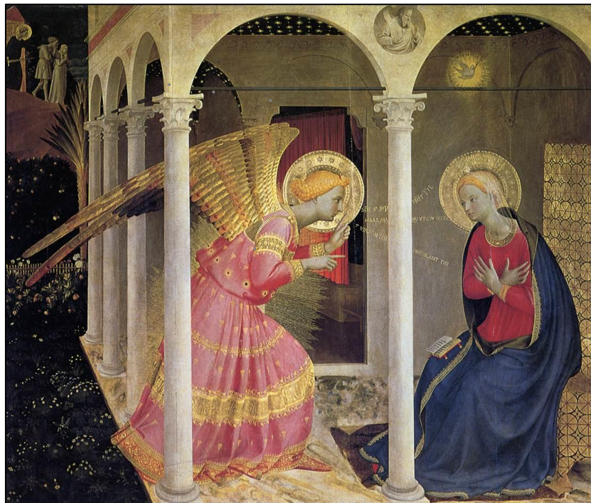
ANGELICO, Fra, Annunciation Cortona, 1433-34