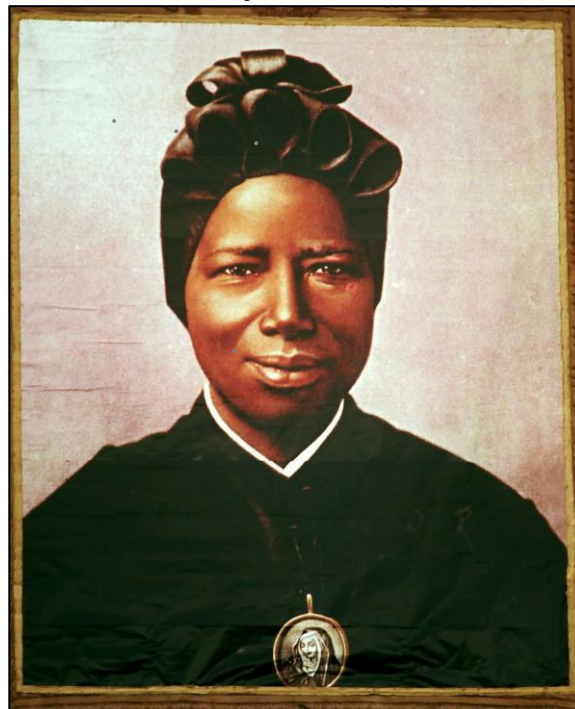
St Josephine Bakhita