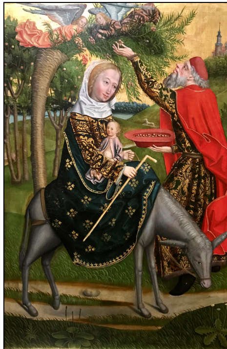
STUMME, Absolon, The Escape to Egypt, 1499, National Museum of Poland, Warsaw

Sunday Masses: Saturday Vigil: 4:00pm (Mass in Polish) 6:00pm Sunday: 8:30am 10:00am Weekday Masses: Monday–Friday 8:00am Saturday 8:30am Sacrament of Reconciliation: Saturday after 8:30am Mass Baptism, Marriage Please contact the Parish Office