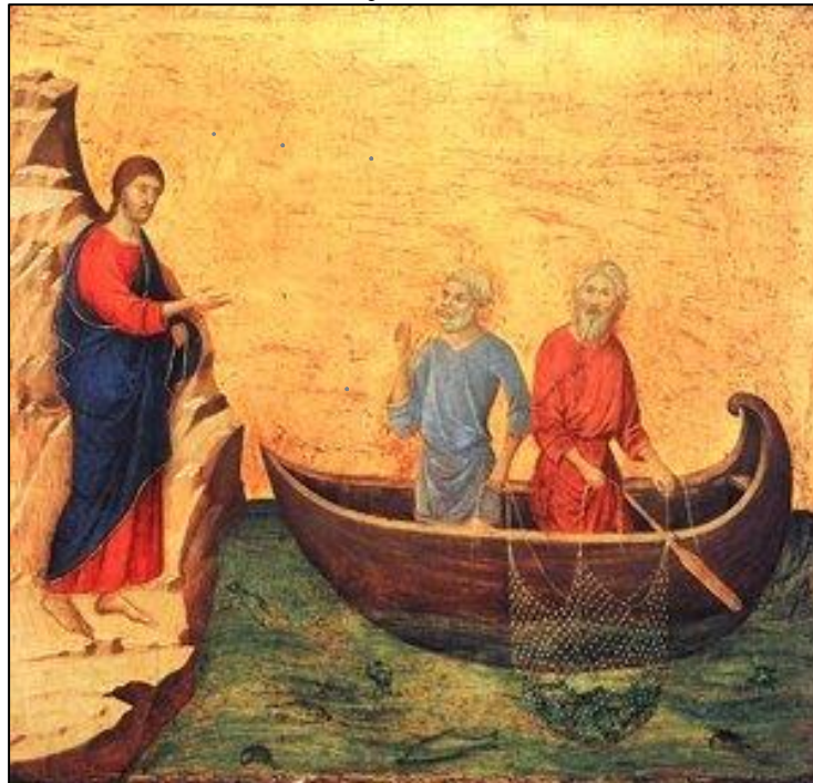
BUONINSEGNA, Duccio di, Calling of the Apostles Peter & Andrew, 1308-11